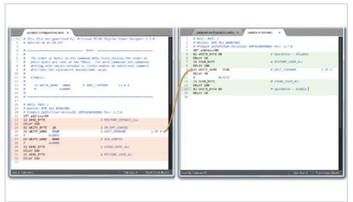
Figure 3: Modifying an SMBS file exported from Flex Power Designer to function as an update

Figure 2: Example of making a single change to a new project then exporting it as an SMBS file